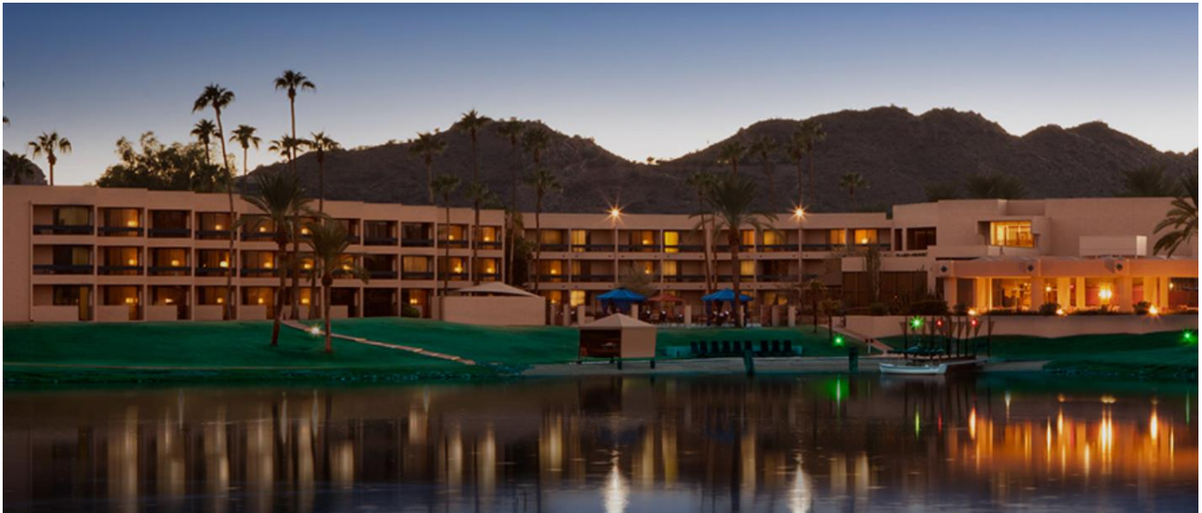
The McCormick Scottsdale - 7421 N. Scottsdale Rd., Scottsdale, AZ 85253.

We are currently accepting reservations. Call, write, or email.